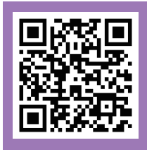
▲ Exhibitor List of Booth No. Order